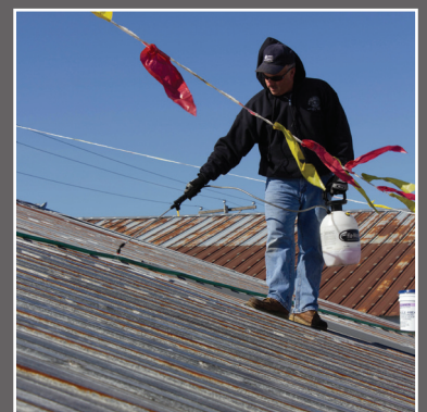
Using airless sprayer.