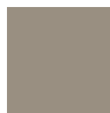
Santa Fe Tan

*Colors shown are representative of product. Actual colors may vary.