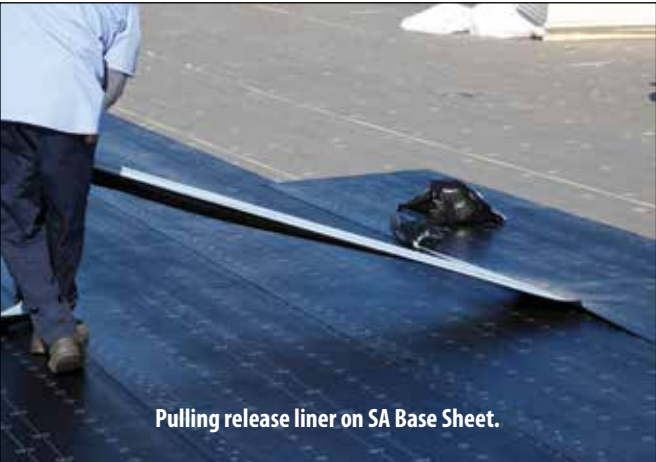
Pulling release liner on SA Base Sheet.

The competitive information is assembled using the latest information available in the marketplace. Every effort has been made to ensure its accuracy. If you should have any questions, please contact the appropriate manufacturer.