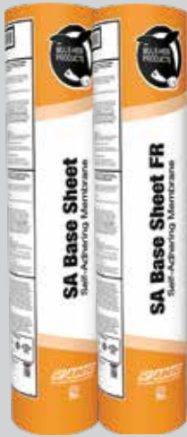
SA BASE SHEET SA BASE SHEET FR