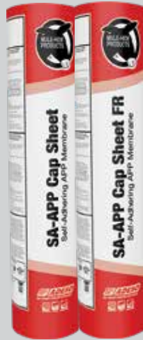
SA-APP CAP SHEET SA-APP CAP SHEET FR