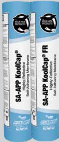
SA-APP KOOLCAP SA-APP KOOLCAP FR