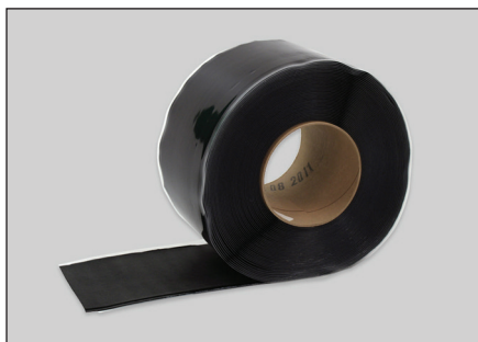
Cured Cover Tape. (Sold Separately)

The information herein should not be considered all-inclusive and should always be accompanied by a review of the MuleHide specifications and guidelines and good application practices.