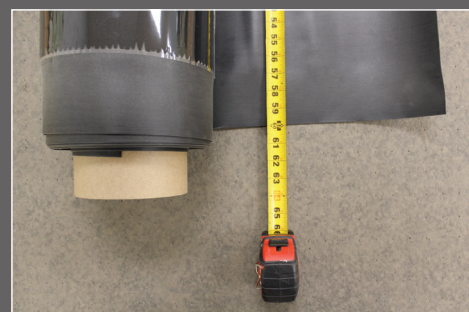
5' wide rolls.