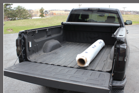
Fits in the back of a pickup truck.