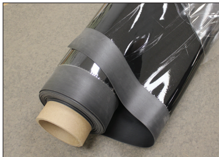
Bottom of factory edge.