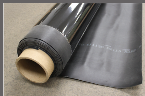
5' x 40' SA EPDM.

Sold by the pallet in quantities of 12. Weight per pallet is 1,064 lbs.