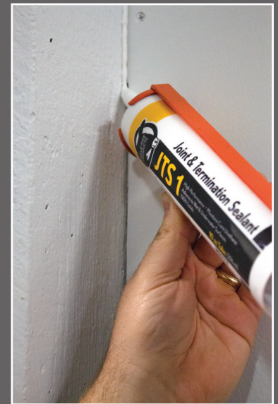
Sealing a joint with white JTS 1 joint and termination sealer.

The information herein should not be considered all-inclusive and should always be accompanied by a review of the MuleHide specifications and guidelines and good application practices.