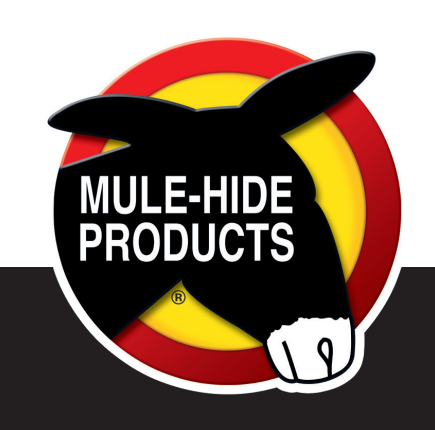
Rugged • Time-Tested • Weather-Tested

The Right Choice for Low-Slope Roofing Products 800-786-1492 • mulehide.com