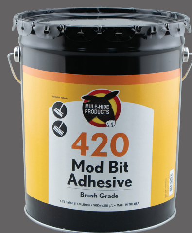
Packaging: 4.7 Gallon Pail