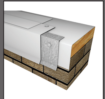
Drip Edge (PVC & TPO)

Contact your local territory manager to learn more.