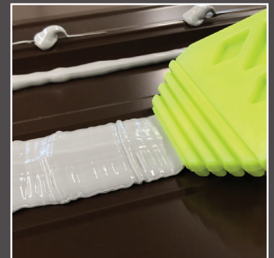
Application with ribbon nozzle