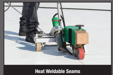
Heat Weldable Seams